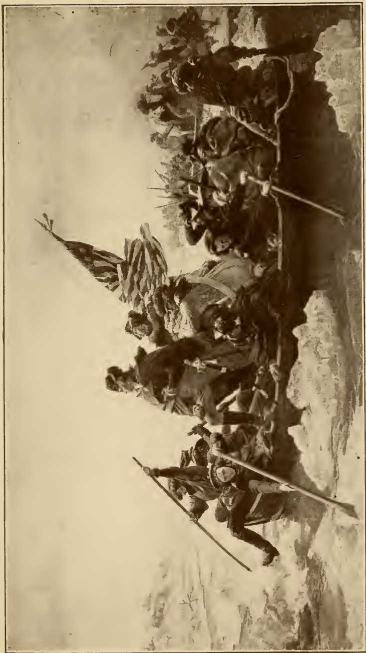
WASHINGTON CROSSING THE DELAWARE